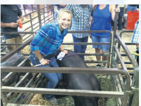
A great Showing